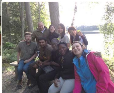
Field-Simulation Camp (Finland)