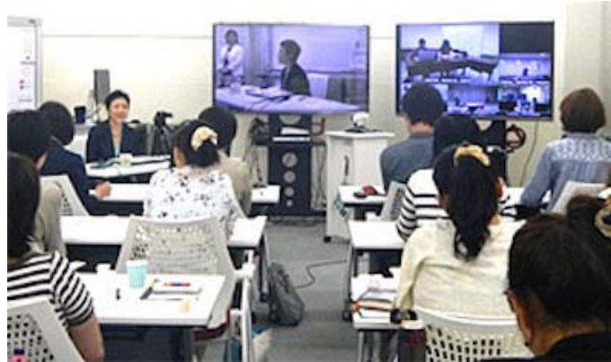
Remote Class using Video System