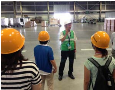
Training Program on Logistics