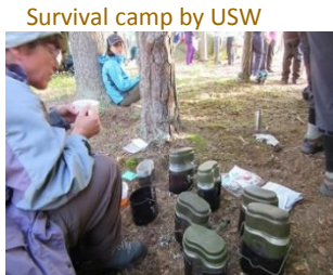
Survival camp by USW

Theory of Professional Collaboration and Practice Disaster Medical Sciences