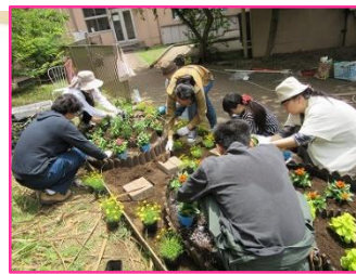
Garden workshop collaborating with Faculty of Horticulture