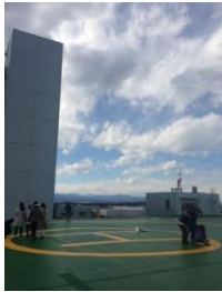
National Disaster Medical Center

Theory of Professional Collaboration and Practice Disaster Medical Sciences