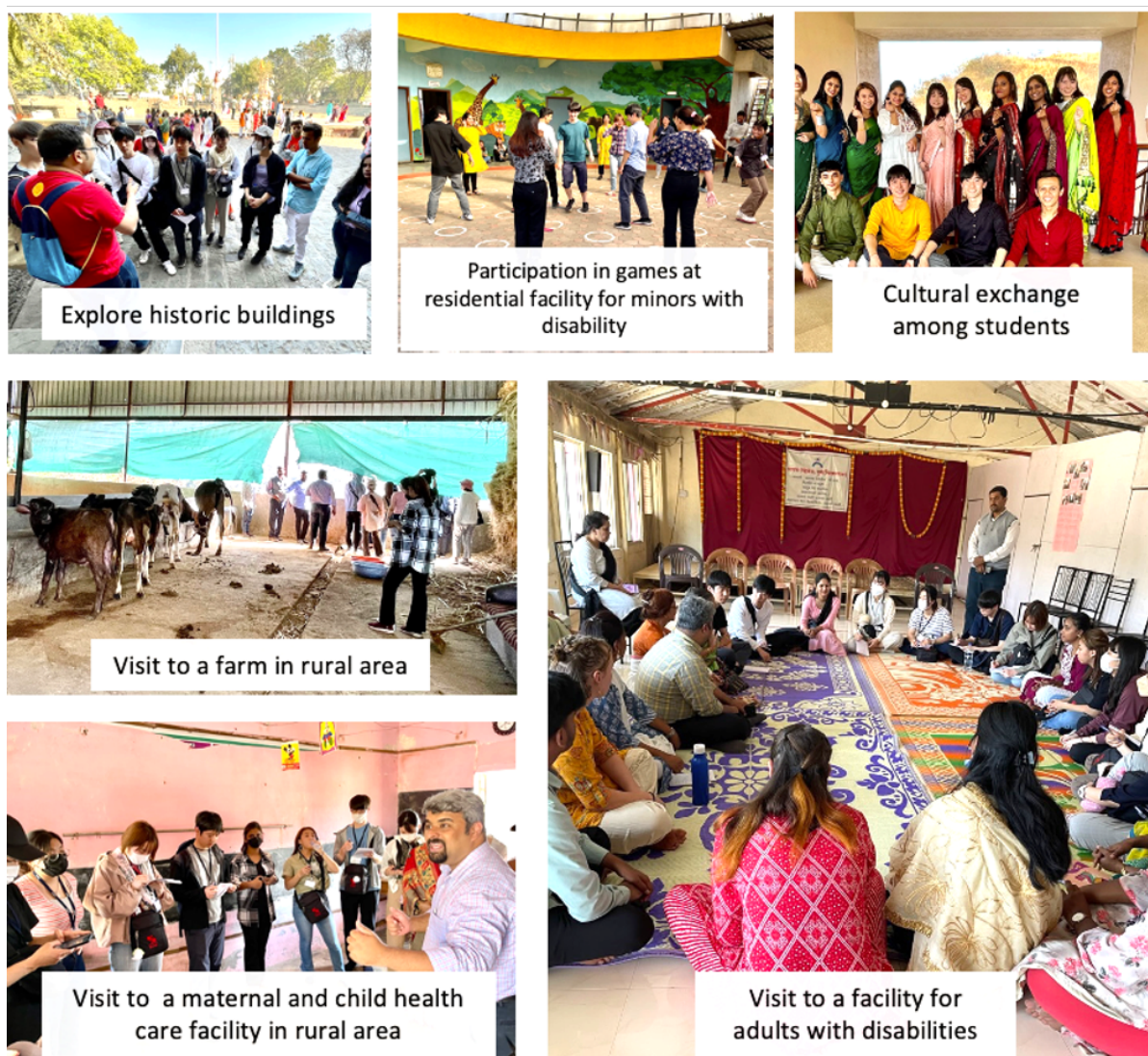
図 17 千葉大学学生のインドでの現地演習の様子